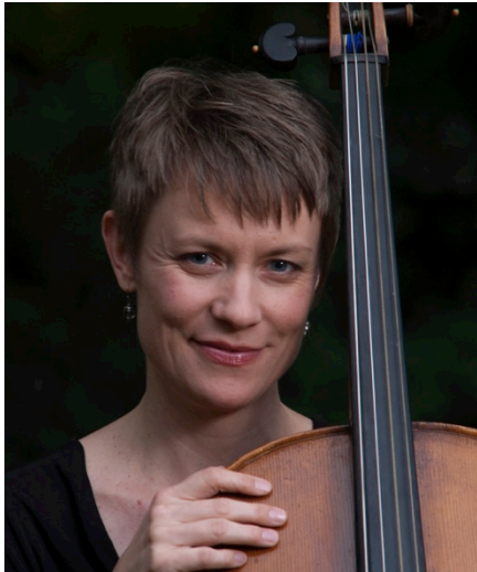
Text swiped from zoominfo.com

We are so very grateful to Joanna for stepping in at the last minute to lead the Play Day that Margriet had scheduled for herself.